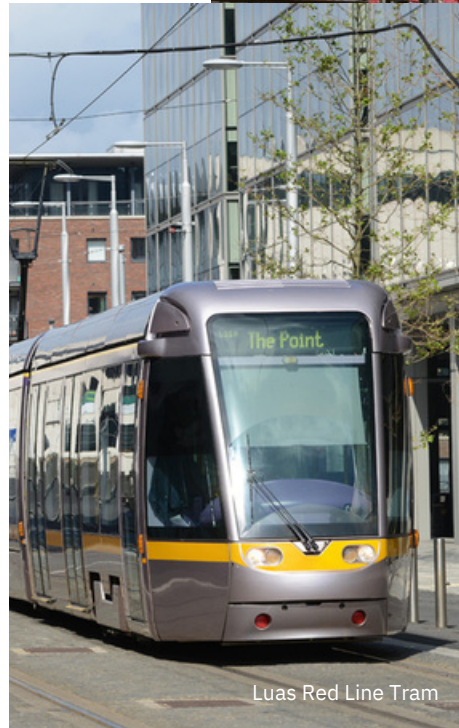
Luas Red Line Tram